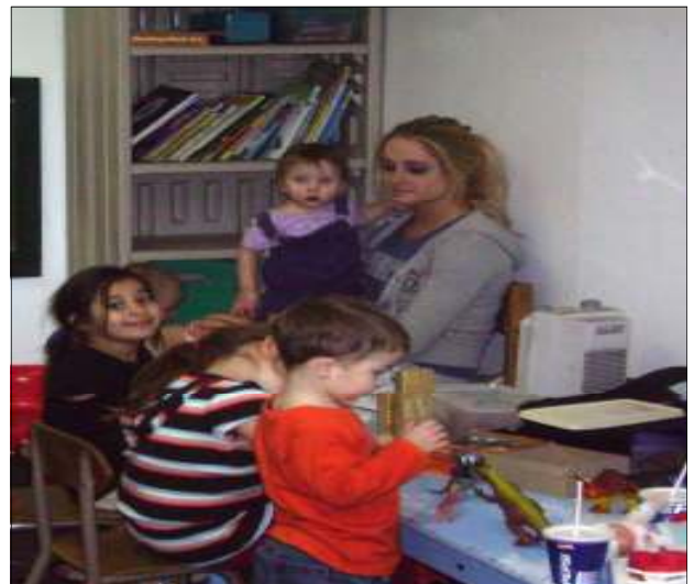
Bay Area Athletic Club